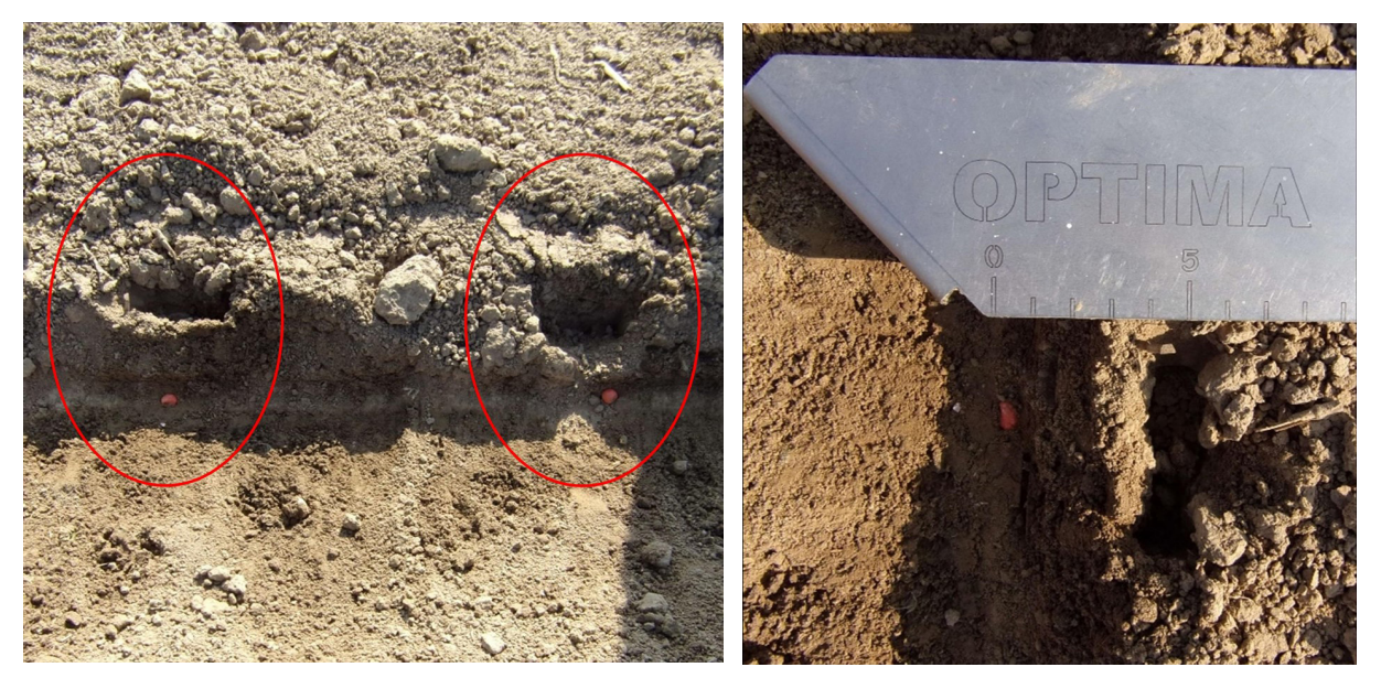
Figure 1: Representation of a randomized check of the manual fertilizer application by exposing the seeds and measuring the horizontal distance between fertilizer and seed (right)

Since the technology for precise starter fertilizer placement was not available at the beginning of the trials, the discontinuous variant was precisely applied manually over all four rows. The seed drill used (GEO-Seed Level I) enabled synchronized seed placement (parallel sowing) to allow determining the seed position without manually exposing the seeds in the two central rows relevant for assessing later. This facilitated a time-synchronized placement of the seeds over all four rows, allowing indirect detection of the seeds in rows 2 and 3 by exposing the seeds in rows 1 and 4. When manually applying starter fertilizer precisely, special attention must be paid to a coordinated chronological sequence of the work steps, as there is a risk that the seed furrow will dry out considerably and the field emergence will be poorer as a result. Likewise, the manual placement of each fertilizer portion requires a high degree of accuracy in order to maintain the desired horizontal distance of 5 cm to the seed, whereby small deviations cannot be avoided. Regular checks of the placement accuracy ensure that the requirements are met. An example of such a check is shown in Figure 1. The tool for manual fertilizer application places a portion of fertilizer about 50 mm long and 10 mm wide parallel to the seed row. The horizontal and vertical distance between seed and fertilizer placement is identical to conventional band starter fertilizer placement.