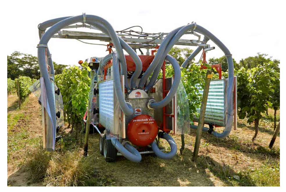
Figure 2: Prototype UV-C 4

only the base frame and the fan are required, while container, pump, etc. can be dismantled. The prototype UV-C 4 is equipped with two UV-C modules per side. This design allows the simultaneous treatment of two rows of vines. To adapt to the particular row width and height, the modules are hydraulically adjustable laterally and vertically. The power supply, an engine-driven generator, and the electronics for controlling the modules are housed in four rack systems on the trailer. Each of the modules is equipped with mercury-vapour lamps with a radiation length of 1.5 m. The total electrical power per module is 3.8 kW.