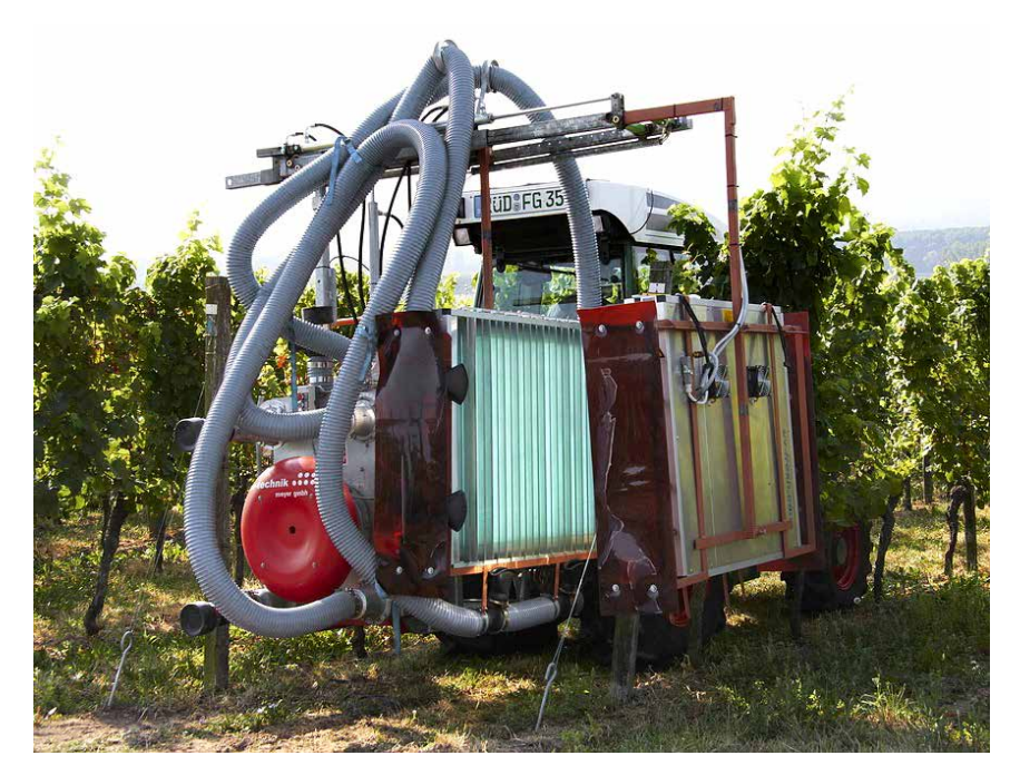
Figure 1: Prototype UV-C 3