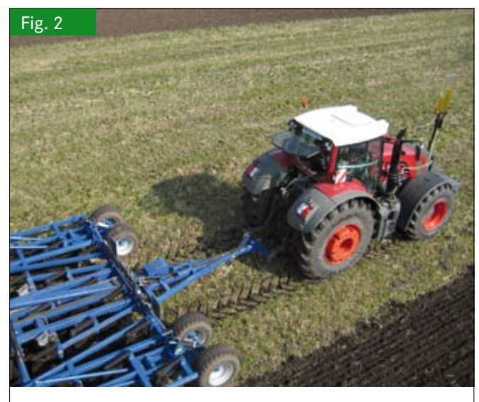
Fig. 2: Adjusted tire inflation pressure (pictured: 0.6 bars) results in less soil deformation and more driver comfort

slip and substantially improve the protection of the soil. The diesel fuel applied is better utilised through reduced wheel slip losses and by draught efficiency.