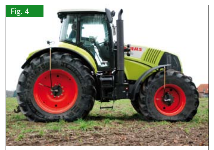
Fig. 4: Backfitted "Strotmann" Central Tire Inflation System (CTIS) (appr. 2.500 €) with air hoses above the fenders. System functions are centrally managed with the StG-Terminal