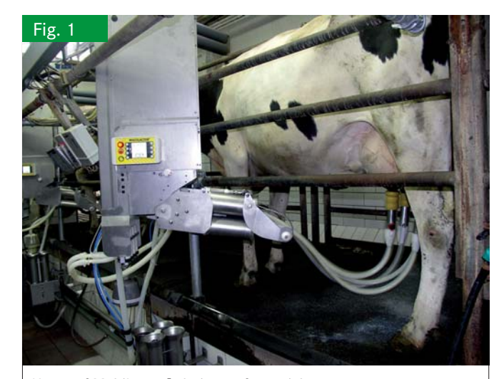
Usage of MultiLactor® during on farm trial

In the analysis of milk flow parameters, means of both milking systems were compared. On average 1.21 kilograms more milk per cow was milked with the MultiLactor<sup>®</sup>, compared to the conventional milking system. Looking at the total milking time, it became clear that cows milked conventionally had a 2.68 minutes lower milking time per cow as cows in the MultiLactor®-group (figure 2). It should be noted that the milking time is very individual for each animal. The greatest differences between both milking systems can be found concerning the incline phase. The study showed that milk flow curves in the MultiLactor<sup>®</sup>-group had a considerably shorter incline phase with on average 19.2 seconds per cow. Cows reached the plateau phase within 25 seconds in all experimental weeks. In contrast, all cows milked by the conventional milking system, needed to reach plateau phase at least 48.6 seconds per cow throughout the whole experiment. They had an average duration of incline phase of 60 seconds. Concerning the duration of plateau phase, it was detected that quarter individual milked cows had on average a 3.22 minutes longer plateau phase. Looking at the decline phase, the difference between both milking systems were smaller. The average duration was 2.71 minutes for the MultiLactor<sup>®</sup>-group and 2.45 minutes for the conventionally milked group. Comparing milk flow parameters between