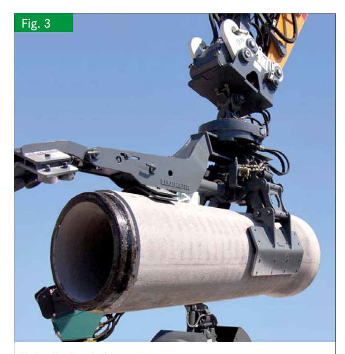
Hydraulic shovel with attachments

■ Further miniaturisation and form adjustments of RFID systems and the realisation of more complex packaging