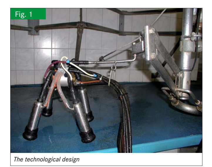
Two LactoCorder tests, respectively at begin and end of trial, were carried out to analyse milk flow. Hereby, total yield, flow increase, flow plateau and milking-out phases were measured with all milking cows. Because of the higher production at morning milking the tests were carried out then. In the evaluation, 75 cows had complete records and these cows were distributed as evenly as possible between trial and control groups. Recorded details were assessed and transferred into descriptive statistics. Information on teat condition and technical milk flow parameters was processed and subject to bifactorial variance analysis and covariance analysis. Factored-in as model effect was lactation number and lactation day. Additionally, two evaluation variants were selected so that all collected data could be optimally evaluated. In the first variant 'A' were included animals that had taken part in the trial for at least three weeks,

with arrival and departure dates taken account of. The second variant 'B' included only the animals in the trial during the entire period from August to December. This group therefore produced complete data.