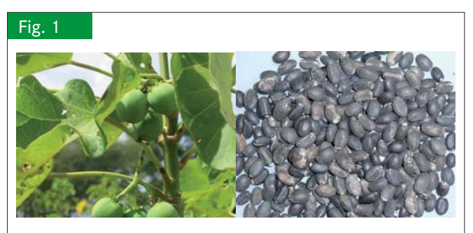
Jatropha curcas fruits and seeds

Jatropha can be utilized for different purposes, it can be used for erosion control, recreation, fire wood, grown as a live fence; the bark is rich in tannin and produces a dark blue dye. Leaves have been used for rearing of silkworm, in dyeing and in medicine as anti-inflammatory substance. Seeds have been used as insecticide, soap, and varnish production. Seed cakes have been used as fertilizer, solid fuel, or in biogas production. Non toxic varieties or detoxified press cake has been used as fodder for animal [1, 5]. Despite all various purposes, the application as fuel is probably the most interesting one for both economical and ecological point of view [6].