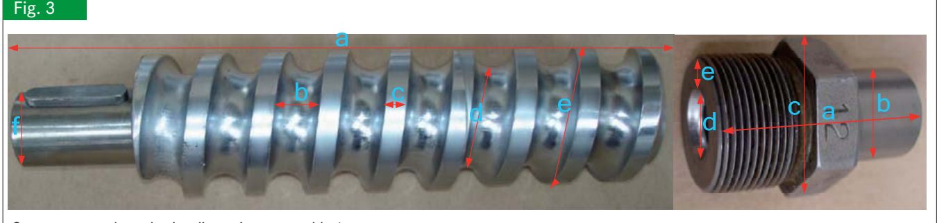
Screw press and nozzle size dimensions, see table 1