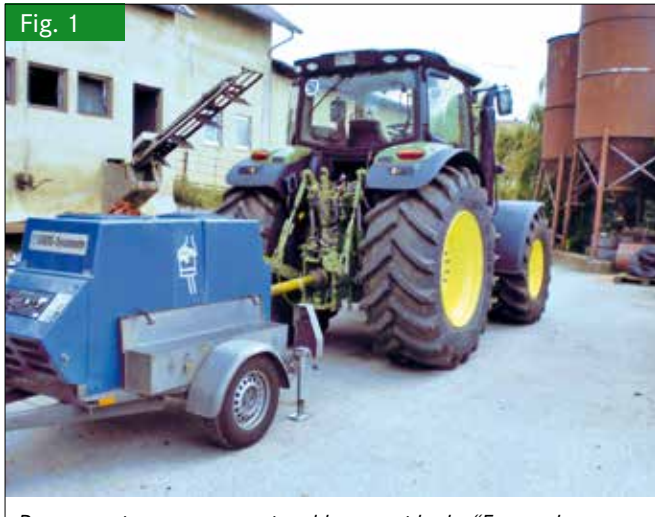
Dynamometer measurement - eddy current brake "Eggers dynamometer" at the PTO

also equipped with GPS data logs for the transport comparisons so that actual speeds and stretch profiles were automatically recorded with the routes displayed as "paths" and utilised for the further evaluations.