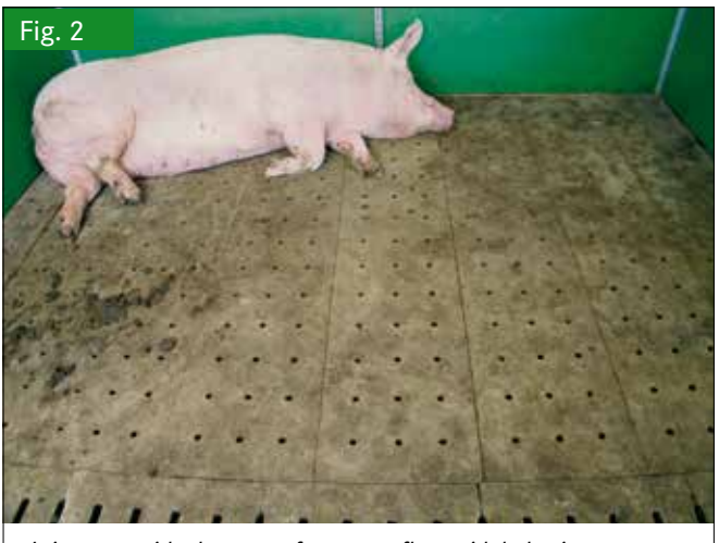
Lying area with elements of concrete floor with holes in the control pen