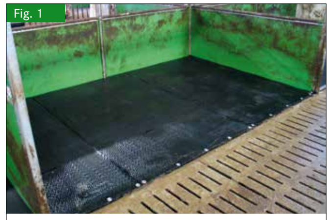
Lying area with rubber mats in the experimental pen

Because the long term effect of the type of floor in the lying area should be tested, sows that had been introduced into to pen with rubber mats in their first experimental pregnancy, were also kept on rubber mats during each of the fol-