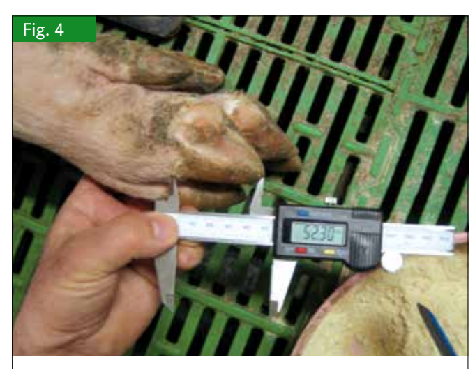
Measuring the claw's length

lowing pregnancies. Similarly, sows of the control group were always introduced into the pen with slatted floor. At the end of the fourth week of pregnancy sows were brought to the group pens directly from the gestating unit, where they were kept in individual stalls. Experimental and control pens were populated always at the same time with an almost equal number of sows.