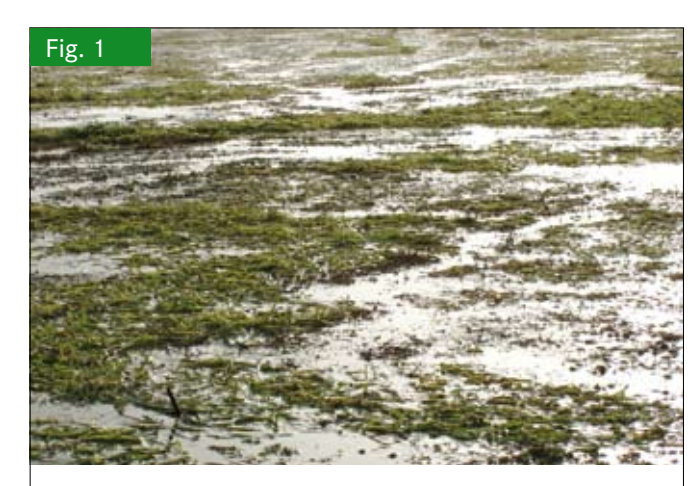
Fig. 1: Elodea nuttallii in the 'emnader lake' close to Bochum in October 2009

free of charge. In this way, organic waste could be used as a cost-effective substrate for biogas plants and disposal costs could be avoided. Samples from five lakes in Germany have been investigated in a discontinuous fermentation test as per VDI 4630 ( table 1 ) in order to determine the extent of the variation in the fraction of Elodea that produces energy.