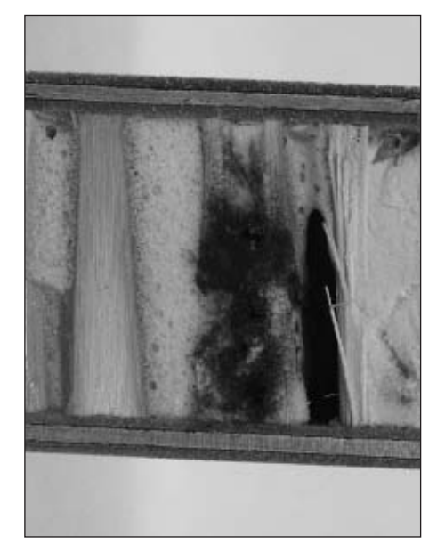
Fig. 3: Growth of fungi on a stalk core of Triarrhena

An indication for this can also be seen in the occurrence of mould fungi growth ( Fig. 3 ). This arises mainly at the edges, i.e. at the cut surfaces of the stems. Here the micro organisms have free admission and possibilities for growth, particularly at the knots. This growth appears here preferentially, because