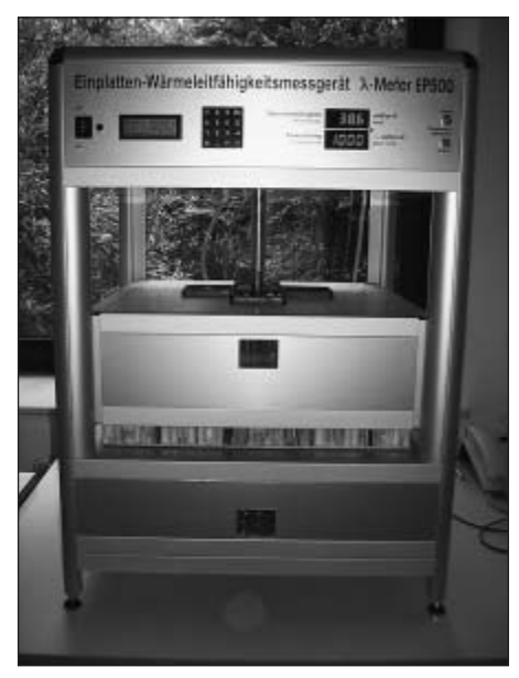
Fig. 2: Measuring the thermal conductivity

segments of the stems were used, because it could be assumed that a reduction of the thermal conductivity would become most clearly apparent here. The structure of the samples was like the structure in the first part of the investigations. The used sample material without wood fibers had a thermal conductivity of \lambda = 0,154 W/mK, that with a filling one of \lambda = 0,130 W/mK. The thermal conductivity was approx. 18 % lower.