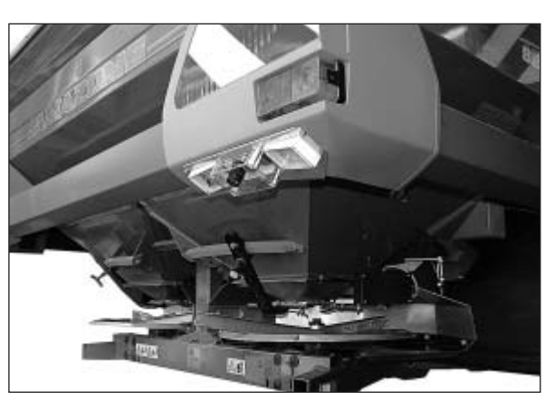
Fig. 3: The camera system Argus from Amazone allows for contactless scanning of the spread fan in order to determine the set values of lateral distribution