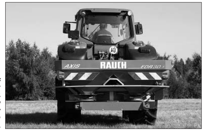
Fig. 4: Rauch drives its two-disc fertilizer spreader electrically, which provides precise fertilizer distribution, low energy input, and high operating comfort.

The areas cultivated using the mulch and direct drilling technique is growing every year. This applies to both drilling and single-grain drilling. According to the latest surveys, more than 50% of the winter wheat area in Germany is meanwhile cultivated without ploughing. The growing importance of these drilling techniques is reflected by the adaptation and optimization of the seed units. Straw or residues of intermediate crops in the drill reduce field emergence and lead to yield and quality losses. Suitable treatment of the mulch layer for better seed insertion is the goal of numerous new developments. "Strip drill", a new cultivation concept for row cultures, which has already been practiced for quite some time in the USA, is also establishing itself in Europe. When this system is applied, the soil is loosened only strip-wise in the area of the later seed rows. Appropriate technical solutions which make strip-wise loosening possible require the use of a GPS-controlled tractor with an automatic steering system in order to be able to place the seeds precisely in the loosened strips.